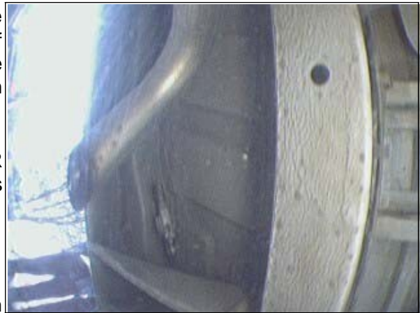
Zoomed image of a feature showing hidden Handgun